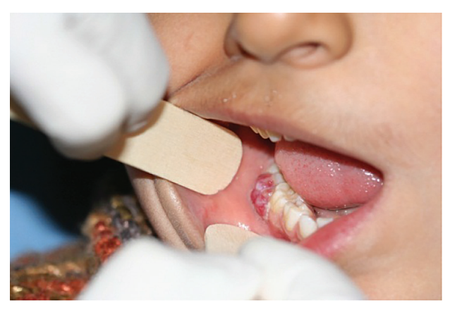
Figure 1. Clinical view of the lesion

Written informed consent was obtained from the patient's parents for excising the lesion by diode laser. The patient and the whole staff were asked to wear protective glasses. After infiltration of local anesthesia,