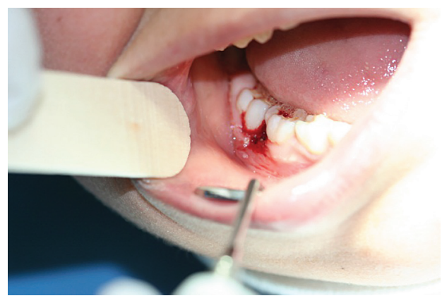
Figure 4. Immediately after excision of the lesion

The specimen was sent for histopathological examination in formalin Buffer Solution 10%. Histopathological view of the specimen stained by Hematoxylin and eosin showed a soft tissue fragment covered by Para keratinized stratified squamous epithelium which was ulcerated and