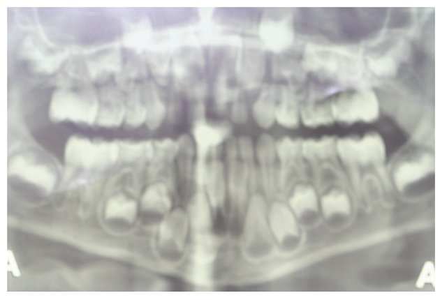
Figure 3. Panoramic view of the patient