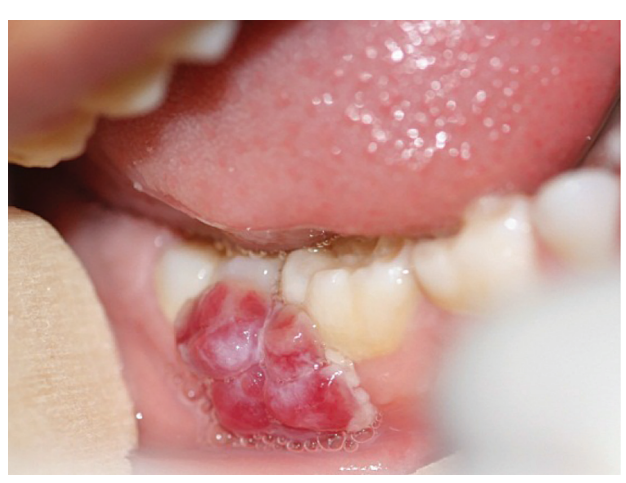
Figure 2. Lobulated exophitic lesion with areas of ulceration