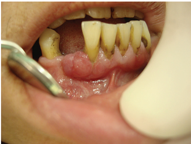
Figure 1. The clinical feature of the lesion

cut the lesion from the base, because the of the laser beams wer not seen by eyes,the guiding light was prepared by manufacture company and was looked as red light during operation, Figure 3.the lesion was cut at the base,but we observed massive hemorrhage from the surgery area and for its control we moved the laser fiber tip in a sweeping way on the surgical site in order to achieve coagulation, after many seconds hemostasis occurred and somehow the surface of the lesion was carbonized, thus, there was no need to suture the surgical site and the wound would be healed with secondary intention, Figure 4. After finishing this process, the biopsy sample was put in a fixative agent (formalin 10% solution) and sent for microscopic evaluation, Figure 5. The result of microscopic evaluation was:” pyogenic granuloma”. Follow up of the treatment process occurred after ten days from removal of lesion, somehow, healing of the surgery site occurred and repair of the epithelium was performed completely; Figure 6.