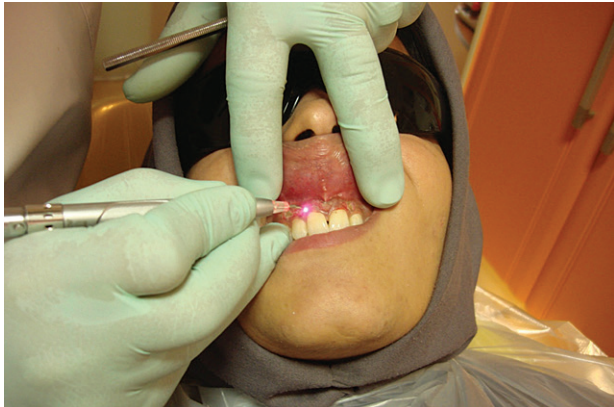
Figure 8. The laser therapy of the lesion with use of Ezlase and contact mode of operation

spite of this some carbonization of the affected area happened (Figures 8,9). During the process despite ventilation the little amount of fume and burning smell