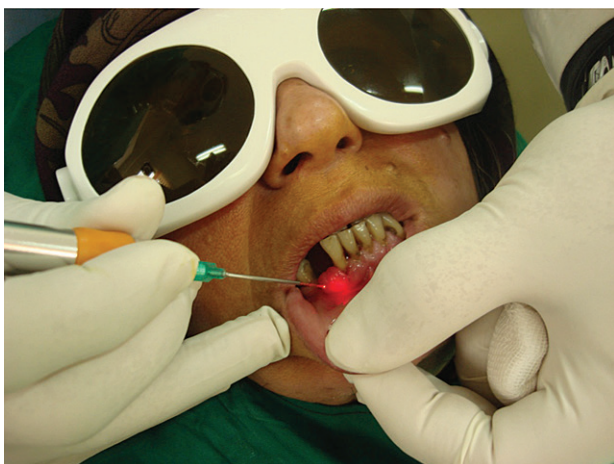
Figure 3. The application the diode laser(Gigga) and view of guiding light during operation