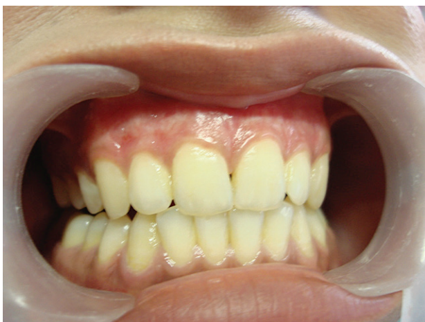
Figure 10. The follow up the patient after one month, the healing was occurred completely, and the pink color of the upper gingiva in comparison to lower gingiva was seen

had caused some discomfort to the patient. The follow up occurred after one month and repair of epithelium was completely achieved, Figure 10.