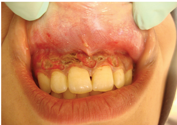
Figure 9. The denuded area after laser therapy, the remnants of epithelium was removed by pulling wet sterilized dental gaz on the area