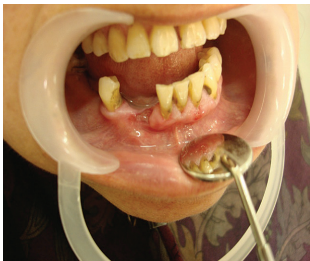
Figure 6. Follow up the patient after ten days