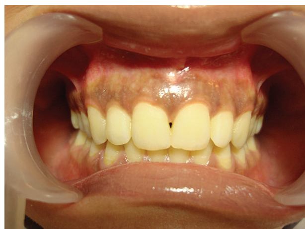
Figure 7. The difusse physiologic hyperpigmentation of gingiva of the patient before laser therapy

The treatment plan was performed; first, the area was anesthetized by lidocaine 2% with epinephrine 1/100000 cartridge by infiltration technique. After this, retraction of upper lip was made by Minoseta retractor. We used diode laser Ezlase 940 nm wavelength, made by Biolase Co (Germany) with 1.5W CW, 400µm fiber, in sweeping motion. The diode laser was set and safety protection such as use of specific room, wearing specific eye glass was applied. Then we used the laser tip on the surface of the lesion in contact mode. In this process almost three minutes after laser therapy, the de-epithelialization of gingiva occurred, then we scratched a piece of wet sterile gauze on the de- epithelialized surface and detached the epithelium, after what the laser was irradiated on the denuded area for coagulation of this area, in