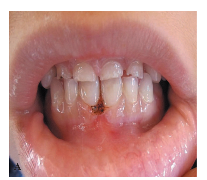
Figure 2. Gingival wart; before and after ablation by co2 laser

Figures 2 and 3 show two cases of gingival wart and excisional biopsy of an exophytic lesion in hard palate