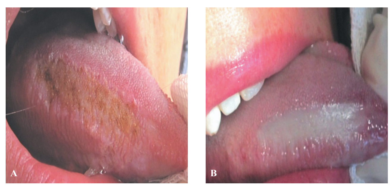
Figure 1. Use of co2 Laser Therapy for Treatment of oral Leukoplakia; before and after ablation

others provide a surface ablation. CO_2 , Er: YAG, and Er, Cr: YSGG laser radiation primarily affects superficial layers of the tissues and hence are advantageous, since the risk of damage to the underlying tissues are minimized. However, deeply penetrating Nd: YAG and diode lasers produce thicker coagulation areas on radiated surfaces (16,21,23), have a greater heat production ability and hence are used similar to electrosurgical procedures (21). Finkbeiner has suggested the application of argon laser in soft tissue welding and soldering compared to traditional wound closure means, such as sutures and tissue adhesives (24).