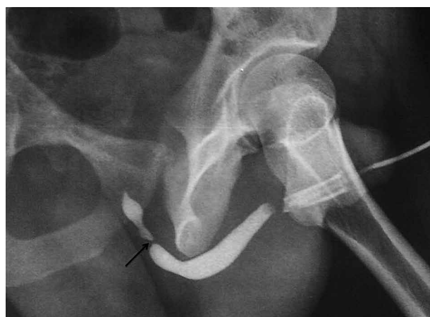
Figure 1. The patient's retrograde urethrography revealing a bulbar stricture (black arrow)

Oral anti-coagulant was changed to IV heparin 2 days before surgery; moreover, heparin was stopped 6 hours preoperatively. The patient underwent intravenous (IV) sedation in the operating room, and rigid cystoscopy with video camera was performed for him. When the cystoscope reached the stricture, flexible tip of guide-wire was introduced per urethra and advanced from the pinpoint lumen with a kind steady force under