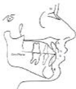
Figure 1: A and B points on the functional occlusal plane