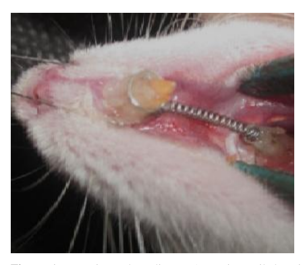
Figure 1: Experimental appliance. An active coiled spring exerted a force of approximately 60 g in the mesial direction

oyo, Japan) with an accuracy of 0.01 mm.