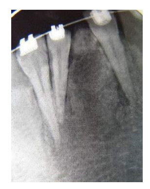
Figure 1: The periapical radiograph of our case showing widening of the periodontal ligament space and a coarse trabecular pattern. These important features were neglected.

In this study, the radiographic features of 7 cases [24, 32-34, 36-38] were in favor of malignancy on the onset, but occasionally these important features were neglected (Figure 1). These aggressive radiographic features included destruction of lamina dura and widening of periodontal ligament space (n=3), diffused mixed radiolucency (a cloudy appearance) (n=4), ill-defined margins (n=5), cortical destruction (n=5), and soft tissue invasion (n=3).