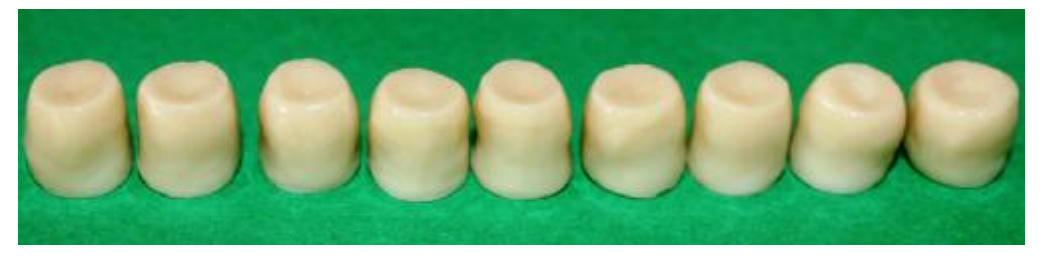
Figure 4: The completed crowns after porcelain firing

at 230 x magnification. High-resolution photographs were captured and displayed on the computer monitor. (Figure 3) Then, the measurements were taken based on the produced images.