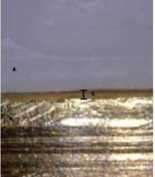
Figure 3: Captured image of coping-die interface (Zirconia coping (A), Brass master die (B), marginal gap (C))

K, Denmark) in which the copings were designed with a