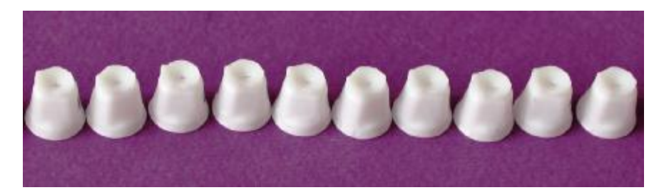
Figure 2: Fabricated zirconia CAD/CAM copings

Preparation of master dies was done in accordance with the current standards of full-ceramic restorations. [1] The preparation was standardized using a 1 mm wide smooth continuous margin, free of any irregularities, with occlusal convergence of 6 degrees with a height of 7 mm. A ledge was formed at the occlusoaxial line angle to serve as anti-rotational feature. The measuring areas for evaluation of absolute marginal gap (AMG) were marked as 18 grooves at 20 degree intervals with a high speed handpiece (KaVo K9; KaVo dental GmbH, Biberach, Germany) and a diamond needle bur on a 2 mm groove below the margin. The sample size and the number of measurements per die were selected based on previous published studies. [15-16]