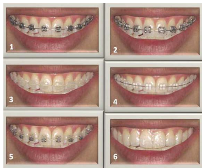
Figure 1: Standardized images of smile with metallic appliances (1,2) ceramic appliances (3,4), hybrid appliance (5) and lingual appliance (14)

Intra-examiner reliability of the VAS ratings was measured by intraclass correlation coefficient (ICC) analysis. Reliability of yes/no responses for acceptability was assessed by the kappa statistic. VAS rating for different kinds of brackets was analyzed by two ways ANOVA; also, VAS rating of brackets in each group was calculated by ANOVA. Post hoc testing was performed by Tukey-LSD and VAS value in males and females was analyzed by Regression. The level of significance was set at 0.05. The data were analyzed using SPSS software (version 19). Acceptability of each bracket in three groups was measured by Chi-square analysis. Acceptability of each bracket between males and females was calculated by Mann U Whitney analysis.