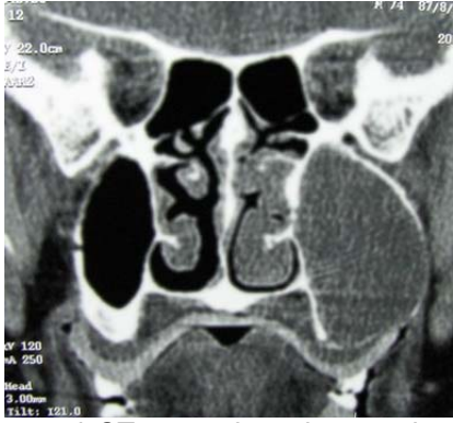
Fig. 4: Coronal CT scan view shows a large expansile tumoral lesion located in left maxillary sinus, displacing medial and lateral walls.

Regarding the size of lesion in antrum, an origin of sinus was suspected.