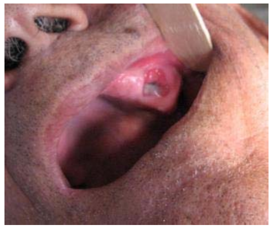
Fig. 1: Clinical appearance of the lesion shows extraction socket and alveolar swelling in buccal aspect.

showed a central depressed part with superficial yellowish-white necrotized tissue surrounded by a narrow erythematic rim and mucosal hyperplasia. The lesion was not tender nor bleeding. There was a bony hard alveolar swelling in buccal aspect of premolar and molar region. No significant pus discharge was detected. Mucosal surface was normal in color and texture. Other parts of oral cavity showed normal color and texture. Oro-antral fistula had been considered as an early diagnosis (Figure 1).