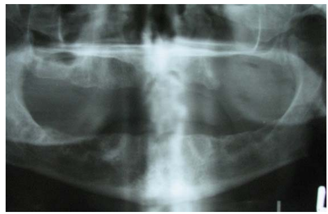
Fig. 2 : Panoramic view shows complete loss of alveolar process in left premolar and molar region.

On panoramic view, complete loss of alveolar process in left premolar and molar region was detected. Borders of left antrum were not clearly visible. There was no remnant of bone trabequla or sequestra (Figure 2). Water's view confirmed loss of borders of maxillary sinus and lateral wall of nasal fossa in the left side. Complete haziness of the left antrum and relative haziness of left nasal fossa compared with the right one was obvious (Figure 3).