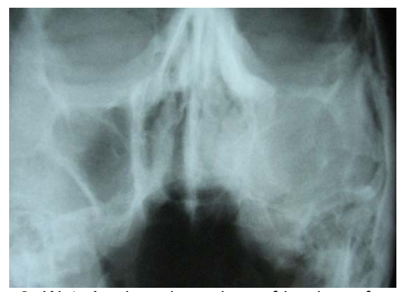
Fig. 3: Water's view shows loss of borders of maxillary sinus and lateral wall of nasal fossa in left side.

CT demonstrated a massive expansile lesion invading the entire left maxillary sinus. The lateral nasal wall and labial cortex of the maxilla as well as ethmoidal sinuses were involved. Osteomeatal complex and inferior and lateral wall of antrum in the left side were not visible (Figure 4 and 5).