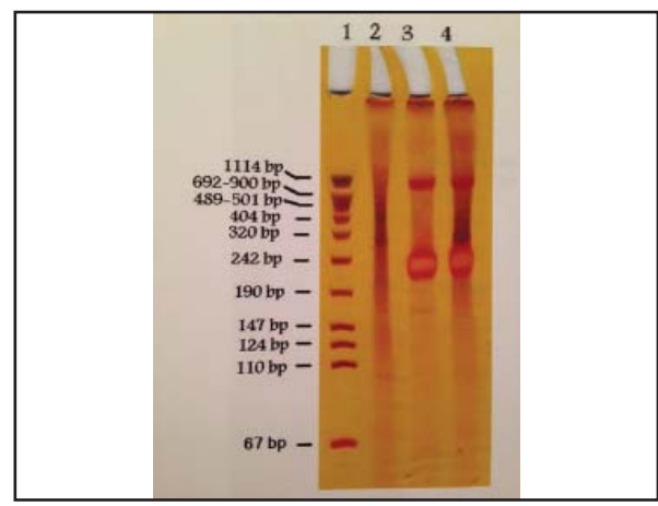
Figure 3. PCR-RFLP result of PM290-F/PM290-R PCR product (290 bp) of Mouse cyst on silver stained 8% PAGE. Lane 1: DNA molecular weight marker. VIII (Roche), Lane 2: 290 bp fragment, Lane 3; RFLP of 290 bp with RsaI (Roche), Lane 4 : RFLP of 290 bp with AvaI (Roche). (The blobs in all wells that include RFLP samples are caused by the enzyme in silver stained).