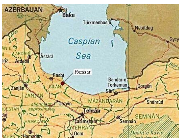
Figure 1. Ramsar, a city in northern Iran has some inhabited areas with highest levels of natural radiation in the world. The city lies between the Elburz mountains and the Caspian sea and has many attractions such as beaches, mountain and jungle for the tourists.

The effective dose equivalents in HNBRAs of Ramsar in particular in Talesh Mahalleh, are few times higher than the dose limits for radiation workers. Inhabitants who live in some houses in this area receive annual doses as high as 132 mSv from external terrestrial sources and