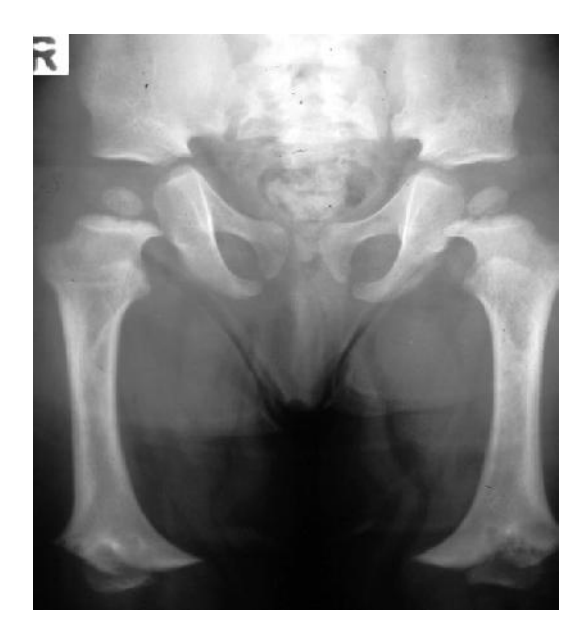
Fig. 1: Short-limbed skeletal dysplasia (The ilia are square and small, femora are broad for their length)

characteristic of achondroplasia, including shortlimbed skeletal dysplasia (Fig 1). The hands were short and broad with fingers exhibiting a three pronged (trident) appearance. The patient was 6 kg (<3p) and 61 cm (<3p) at admission according to acondroplasic percentiles. She was unable to tolerate spontaneous respiration. The results of full blood analysis, erythrocyte sedimentation rate and C-reactive protein were within normal ranges. Moreover, there were no laboratory data suggestive of endocrinopathies, hypophosphatasia and/or hypercalcemia. Cranial MRI revealed extensive foramen magnum stenosis which is known to cause respiratory disorders through compression of respiratory centers and neurons (Fig 2) as well as hydrocephalus and cortical atrophy (Fig 3). The patient was operated at the neurosurgical department of our hospital and posterior fossa decompression was accomplished. The hydrocephaly was not resolved after decompressive surgery and necessitated placement of ventriculoperitoneal shunt. However the patient needed mechanical ventilation for more than 8 months after operation with several attempts to free the patient of the ventilator. During postoperative follow up period she had also hypotension and bradycardia attacks which suggested sympathetic nervous system dysfunction, and needed dopamin infusions