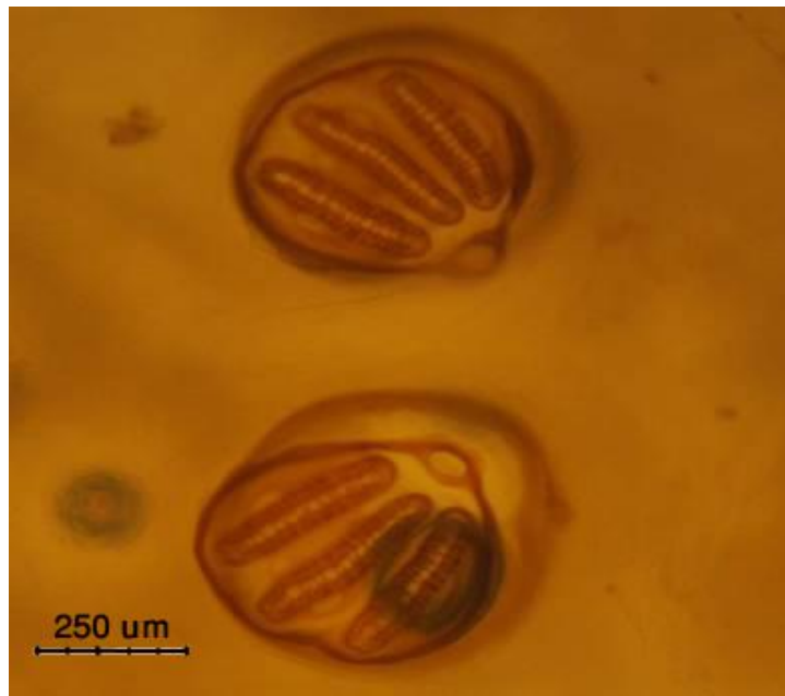
Fig. 2: The posterior spiracle of Lucilia sericata instar