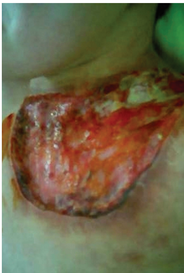
Figure 1. A large Necrotic Ulcer (20 × 10 Cm) on the Left Upper Chest of the Patient With a Normal Appearance