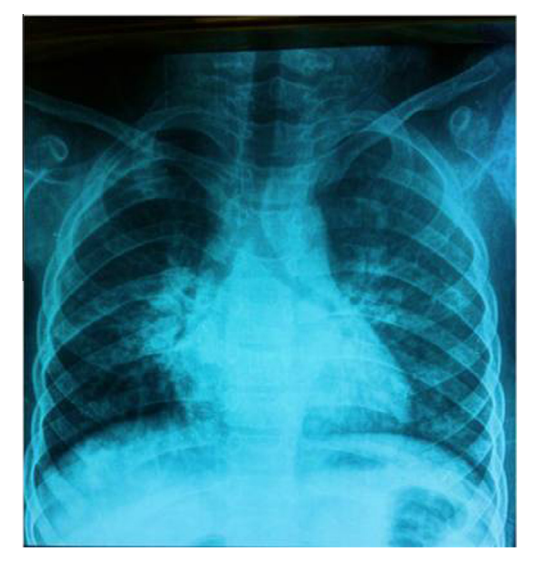
Fig. 4 - X-ray after treatment.

A short-course chemotherapy for treatment of TB was started, which included first-line anti-TB drugs (isoniazid, rifampicin, pyrazinamide, ethambutol), in combination with pyridoxine for the first 2 months, and isoniazid and rifampicin for the continuation phase by directly observed treatment short course. The patient showed good response to treatment within 12 weeks (pulmonary and extrapulmonary lesions). Sputum culture was positive for M. tuberculosis and sensitive to the prescribed first-line anti-TB drugs. In addition, the skin swab culture from the discharging ulcer was positive for M. tuberculosis. The patient completed her 9-month treatment course. Marked improvements of the lesions were noted by the end of treatment (Figs. 4 and 5). Her contacts were screened for the mycobacterial infection and all were found to be free of the infection.