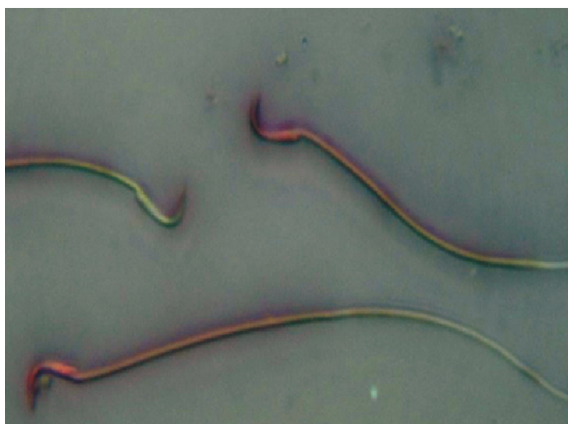
Fig.1: Sperm with altered plasma membranes appeared pink whereas those with intact plasma membranes did not stain (EN ×400).

Data are presented as mean ± SEM. Values with different letters indicate significant differences among groups at p≤0.05.