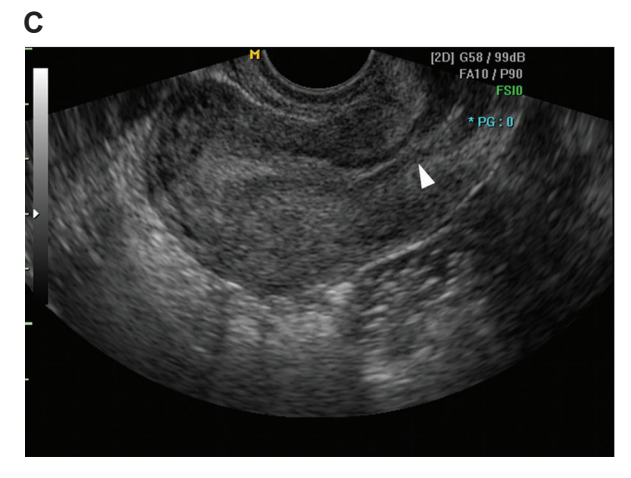
Fig 1: Ultrasound images of endometrium. Echogenisity was decided by the comparison of myomertial echo. Homogeneously hypoechoic endometrium (A) is defined as a marginal hyperechoic line with a prominent hypoechoic inner layer, in which endometrial wave-like movements are observed. Inhomogeneous endometrium (B) shows an endometrium with a hyperechoic margin and a mottled inner layer, and homogeneously hyperechoic endometrium (C) exhibits an inner layer as hyperechoic as a marginal line. Internal os (arrowheads) can be identified.