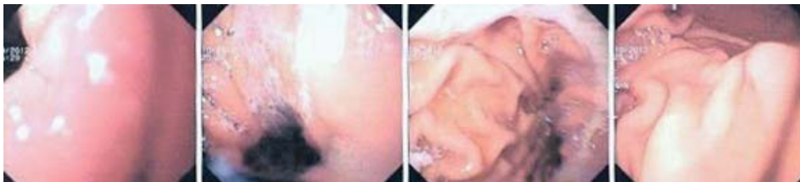
Fig. 2: Upper endoscopy of the patient demonstrating no apparent abnormality.