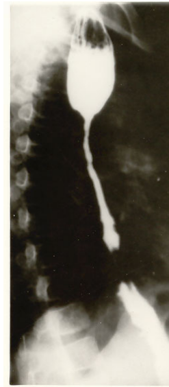
Figure 2: GI series of patient

nonspecific esophagitis. Esophageal manometry was not available. Colonoscopy was normal. She was treated with conjugated estrogen, growth hormone, oral ferrous sulfate, vitamin supplements and repeated esophageal dilatation with marked improvement.