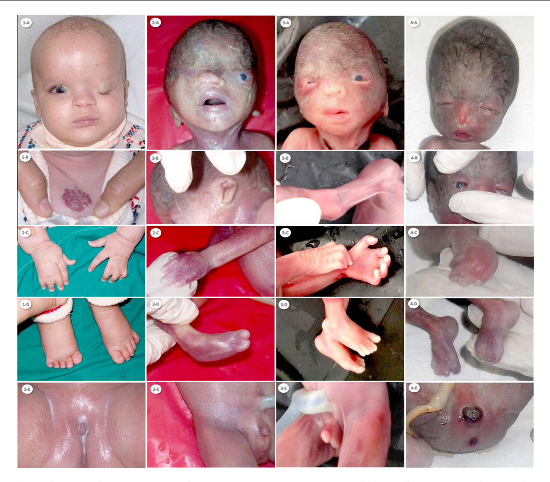
Clinical features of Egyptian cases of FS. Case 1-1: Complete cryptophthalmos of Lt eye with absent eyebrow, upper lid Figure 1 coloboma and sclerocornea of Rt eye, scanty scalp hair, high forehead with frontal bossing, broad nasal root and grooved nasal tip [1-A], prominent hemangioma on upper chest [1-B], partial cutaneous syndactyly between 3rd and 5th fingers [1-C], partial syndactyly between all toes of the right foot [1-D], clitoromegaly with hypoplastic labia and absent vaginal opening [1-E]. Case 2-2: Striking ocular hypertelorism, complete cryptophthalmos of Rt eye, abortive crypto-phthalmos and slanting down of Lt eye, bilateral tongue of scalp hair from parietal region extending to the site of eyebrows, very broad asymmetric nose with thick alae nasi and slit like nares and uplifted ear lobules [2-A], small Lt ear with cryptotia and stenotic external auditory meatus [2-B], complete cutaneous syndactyly between 3rd and 4th fingers of Lt hand [2-C], complete cutaneous syndactyly of 2nd through 5th digits of the Rt foot [2-D], a markedly low-set umbilical cord [2-E]. Case 3-2: Hirsutism of the forehead with the anterior hairline extending almost to the site of evebrows, hypertelorism, coloboma of Rt upper eyelid and absence of eyelashes and Rt eyebrow, abortive cryptophthalmos of Lt eye with absent eyelashes, slanting-down palpebral fissure and cloudy cornea, broad nose with broad columella and narrow nostrils and low-set ears [3-A], axillary web [3-B], camptodactyly of all fingers [3-C], long toes [3-D], low insertion of umbilical cord and abnormal male genitalia [3-E]. Case 4-1: Abnormal skull with aberrant hair growth with the scalp hair extending forward over the forehead, puffy eyelids, abnormal eyebrows, long eyelashes, bilateral sclerocornea, pinched nose, severe micro-retrognathia [4-A and B], extensive cutaneous syndactyly between 2nd through 5th fingers of Rt hand [4-C], rocker bottom heels and complete cutaneous syndactyly between Rt 2nd through 5th toes and between all toes on the Lt side [4-D], abnormal genitalia and anteriorly-displaced anus [4-E].

eye with coloboma of the upper eyelid and absence of eyelashes and the right eyebrow. The left eye had abortive cryptophthalmos with hypoplastic eyelids, absent eyelashes, slanting-down palpebral fissure and cloudy cornea. There was hirsutism of the forehead with the anterior hairline extending almost to the site of eyebrows. The ears displayed cryptotia and low setting. The nose was broad, depressed with a broad columella and narrow nostrils. Camptodactyly of all fingers was noticed while the toes were normal. We also noted neck, axillary and crural webbing, low insertion of umbilical cord and abnormal male genitalia (Fig. 1: 3-A through E).