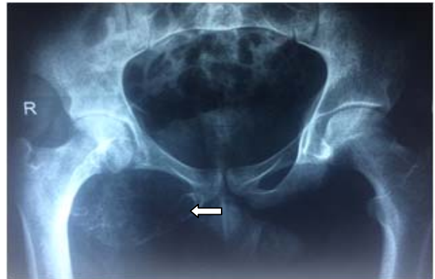
Fig 1. X-ray pelvis including both hip joints shows an expansile, multiloculated, lytic lesion with cortical thinning in the right ischio-pubic ramus (arrow).

The differential diagnosis of ABC, included giant cell tumour chondroblastoma or telangiectatic osteosarcoma, but on the basis of age, clinical history and radiological findings the provisional diagnosis of aneurysmal bone cyst (ABC) was made. Then biopsy of the lesion was taken. The histopathology revealed predominantly chondromyxoid areas, few of these showing cystic spaces lined by giant cells. The stromal cells were uniform having spindle to ovoid nuclei. Areas of haemorrhage were also seen (Figure 3). This confirmed the ABC. Then, the patient underwent surgery with curettage and allografting of bone and recovered uneventfully in post-operative period. Patient is currently on follow up. We will follow this patient till 1 year to assess the recurrence.