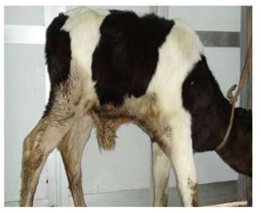
Fig. (2): Umbilical hernia in male calf.