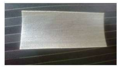
Fig. (3): Polypropylene non absorbable mesh.