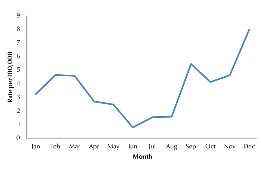
Figure 2 Incidence rate of influenza virus-associated SARI cases (per 100 000 person-year) by month, Damnhour district, Egypt, January to December 2013

study. A recent study has shown high burden of respiratory viruses in this age group (23)