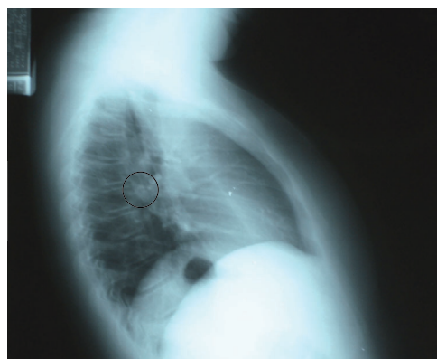
Figure 1 Lateral chest X-ray showing location of tooth (circled)

in the left side of the chest. The child was treated medically and a paediatrician was consulted. On the second postoperative day, there was no improvement, so a chest X-ray was done which showed a whitish shadow, a foreign body in the left main bronchus just above the carina (Figures 1 and 2). Careful examination of the oral cavity revealed that the second maxillary incisor tooth was not found. After explaining to the parents, the decision was taken to do a rigid bronchoscopy under general anaesthesia and the