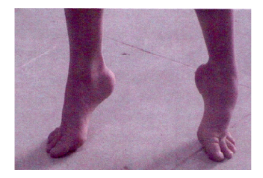
Figure 1 Ankle contracture in the second patient, a boy 3.5 years old

The second case was the 3.5-year-old brother of the first patient. He had had difficulty walking (tiptoe walking) for 8 months (Figure 1). On physical examination there was bilateral severe contracture of the Achilles tendons (Figure 1), positive Gower's sign, wide-based gait and normal sensory examination; deep tendon reflexes were 2/2. All the nerve conduction studies were normal. Electromyography showed polyphasicity