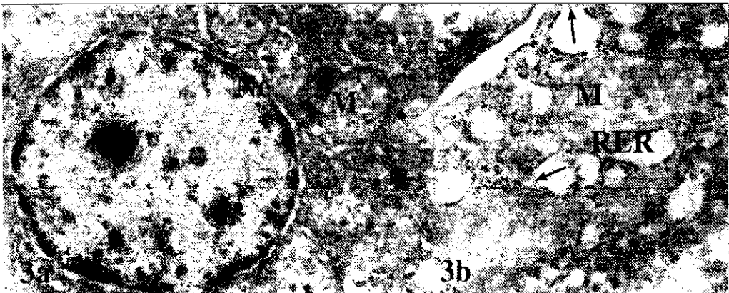
Figure 3 Electron micrograph of section of liver of DMBA + Anoviar-treated chickens, showing irregular and dilated nuclear envelope (Ne), vacuolated mitochondria (M) and dilated rough endoplasmic reticulum (RER) with partial loss of attached ribosomes (→) a (x 10 000) b (x 20 000)