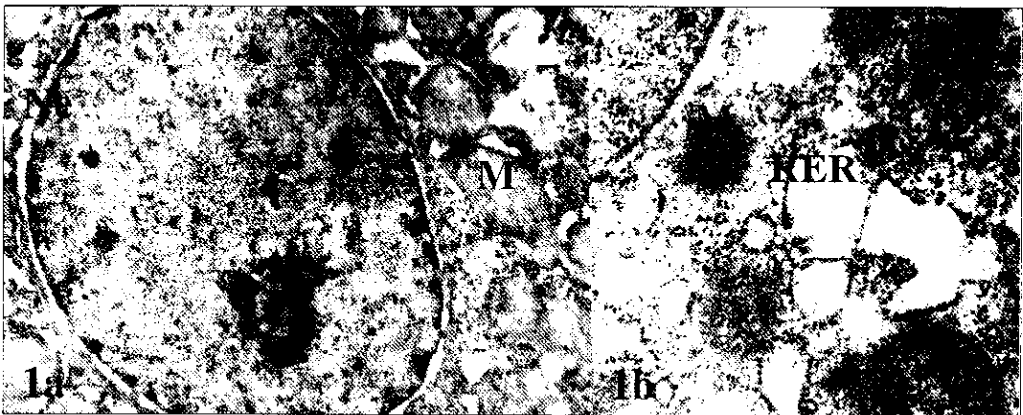
Figure 1 Electron micrograph of section of liver of Anovlar-treated chickens, showing irregular and dilated nuclear envelope (Ne), vacuolated mitochondria (M) and dilated rough endoplasmic reticulum (RER) with partial loss of attached ribosomes (→) a (x 10 000) b (x 20 000)

(Fig. 1). Also, the vacuolation of mitochondria was observed. A common abnormality is the partial loss of ribosomes from the membrane of the rough endoplasmic reticulum (RER), with moderate dilation of the cisternae and loss of aggregation into paral-