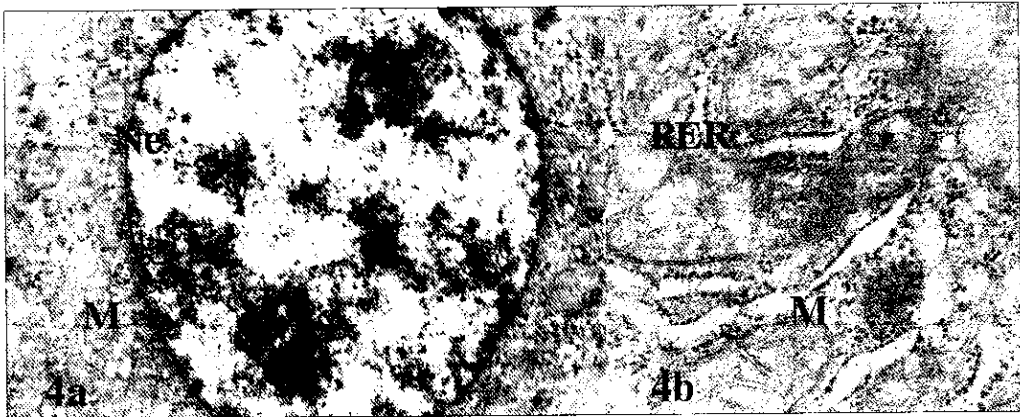
Figure 4 Electron micrograph of section of liver of control chickens showing nuclear envelope (Ne), mitochondria (M) and rough endoplasmic reticulum (RER) a (x 10 000) b (x 20 000)