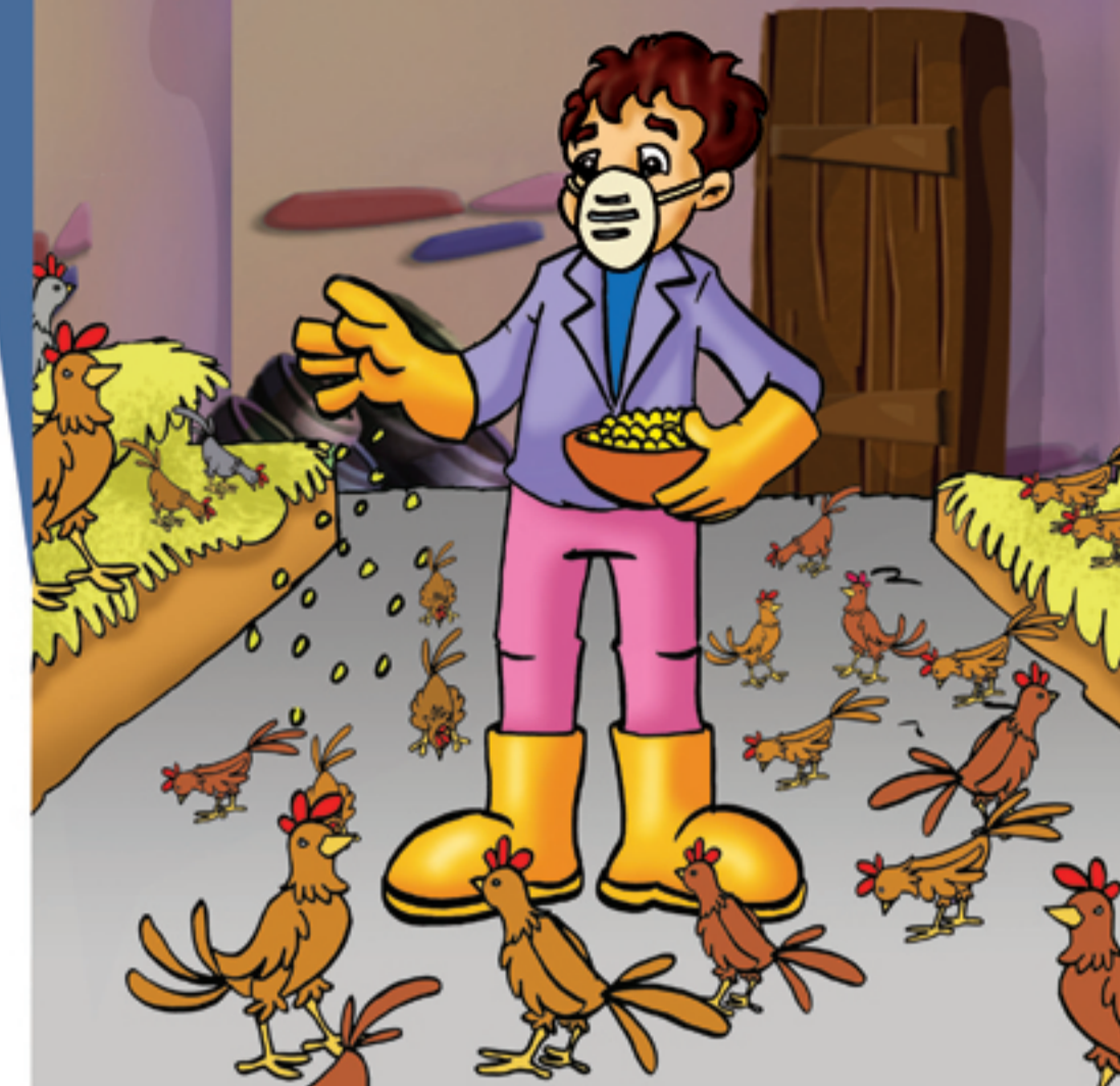
Wear protective equipment when working with birds