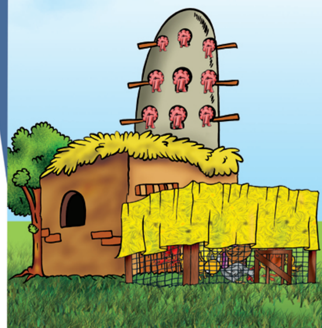
Cover poultry cages to prevent infection from migrating birds