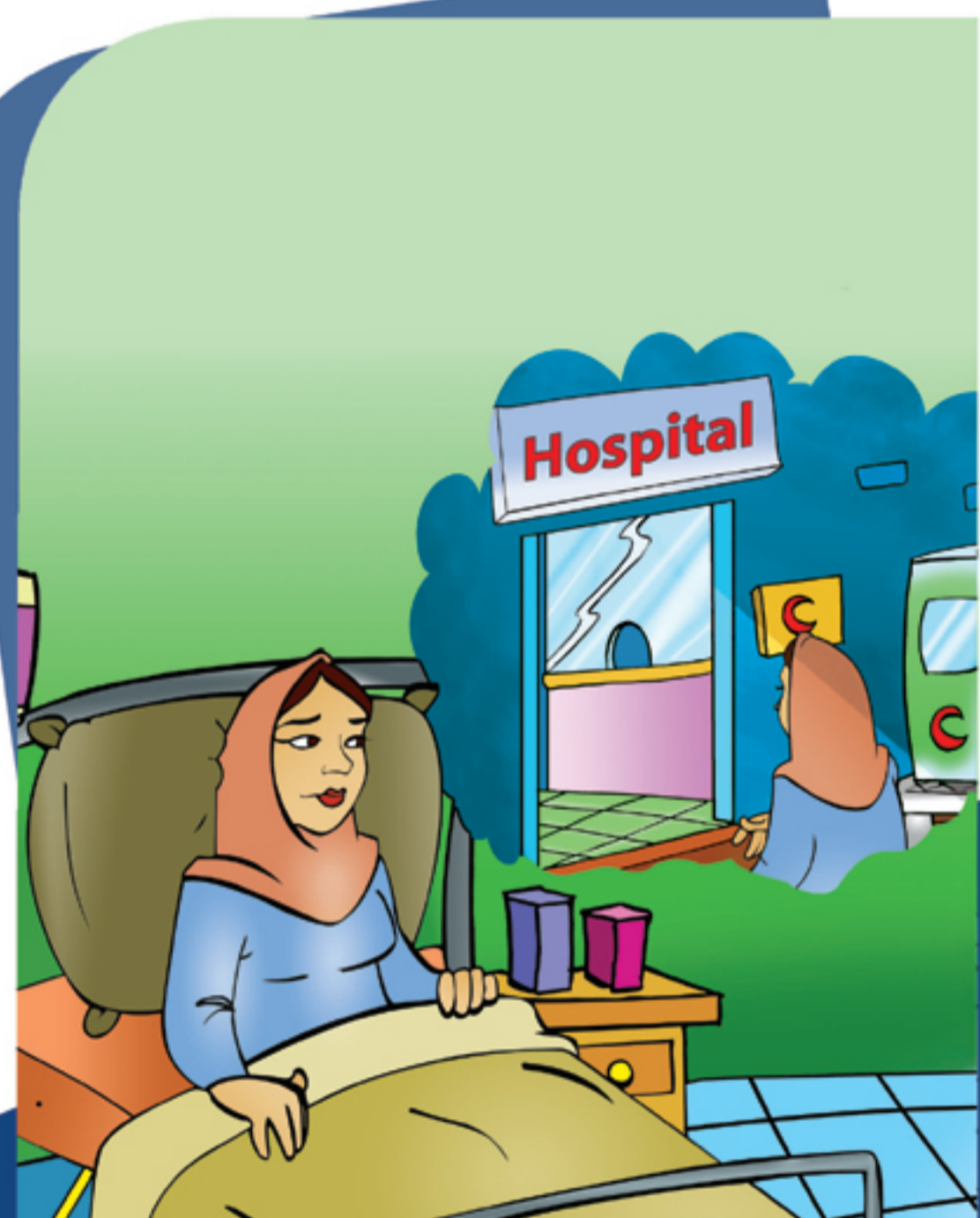
If you are working closely with birds and have flu-like symptoms, go to hospital immediately