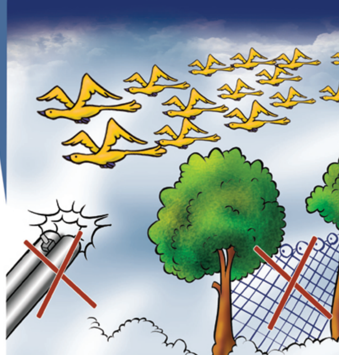
To prevent spread of disease, do not shoot migrating birds