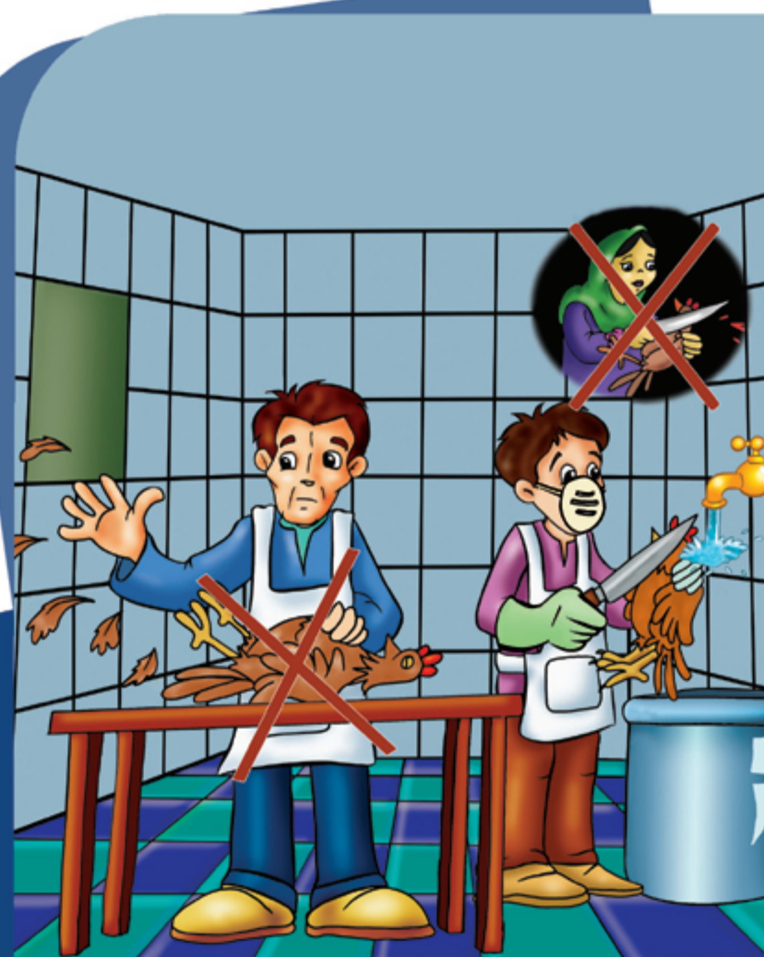
To avoid infection, do not slaughter or defeather birds at home. Leave it to a professional who wears protective equipment