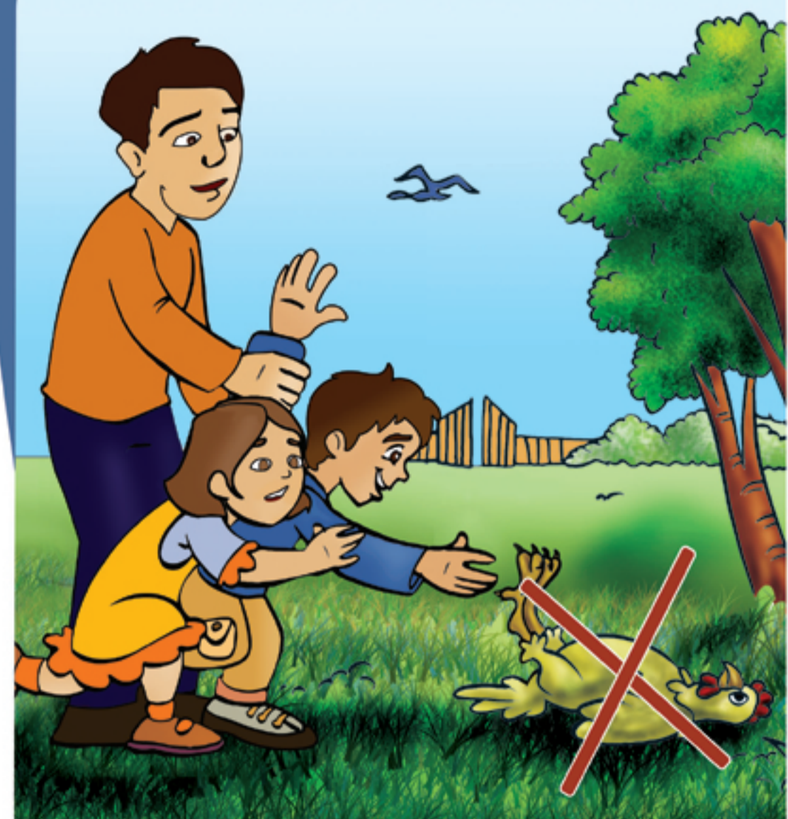
To avoid infection, do not touch or approach dead birds