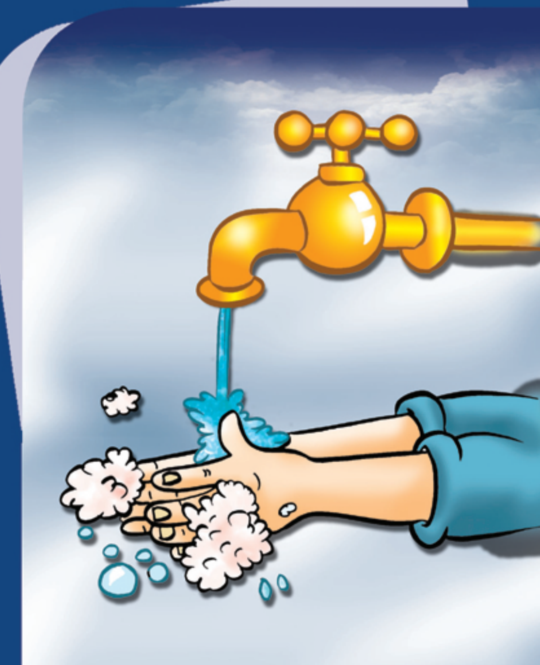
Wash your hands with soap and water to avoid infection