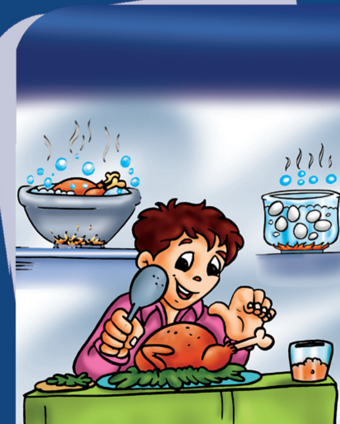
Boiled eggs and well cooked poultry are safe to eat

Join us in fighting bird flu... Be responsible... Make it possible