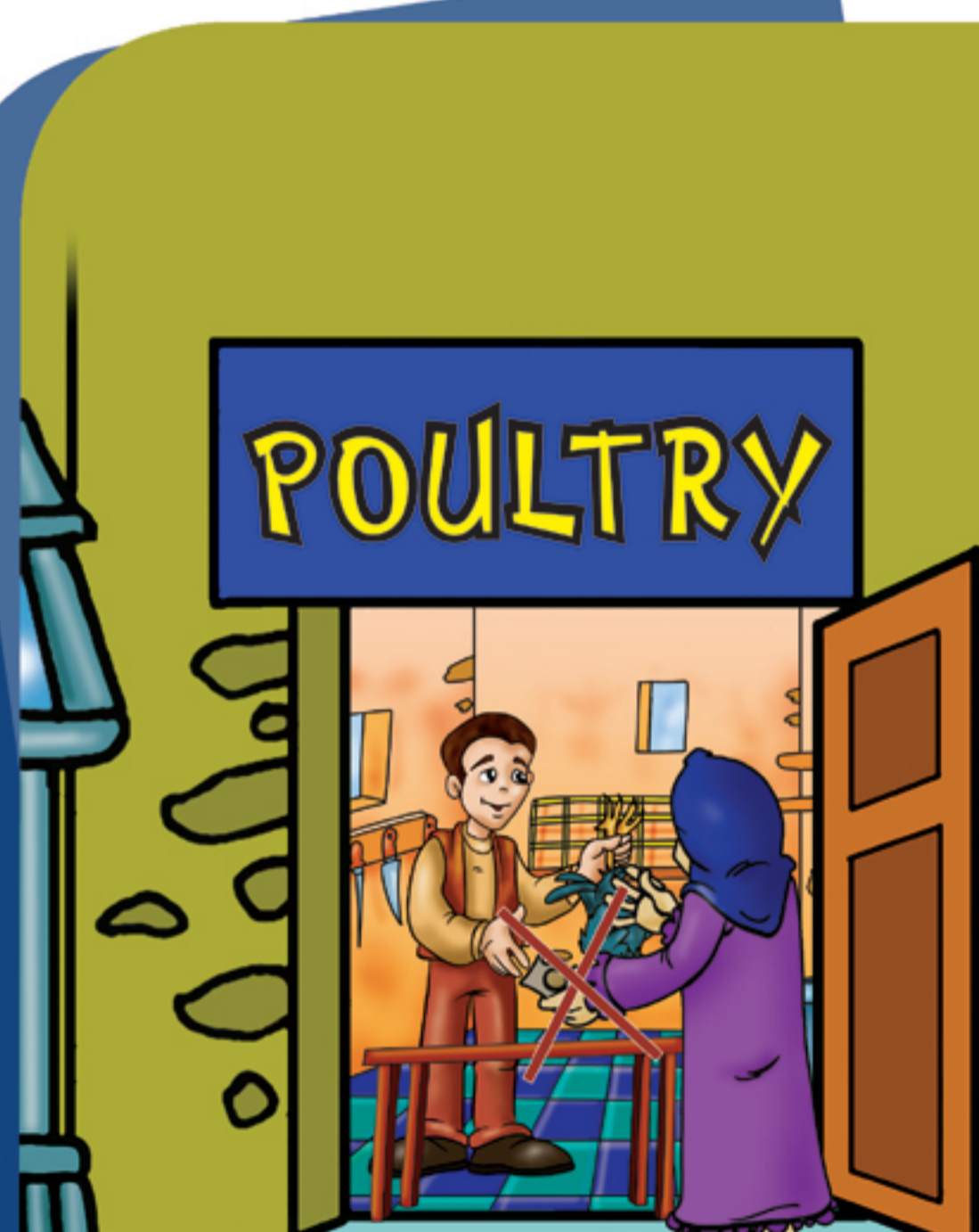
To avoid disease do not buy live birds

Join us in fighting bird flu... Be responsible... Make it possible