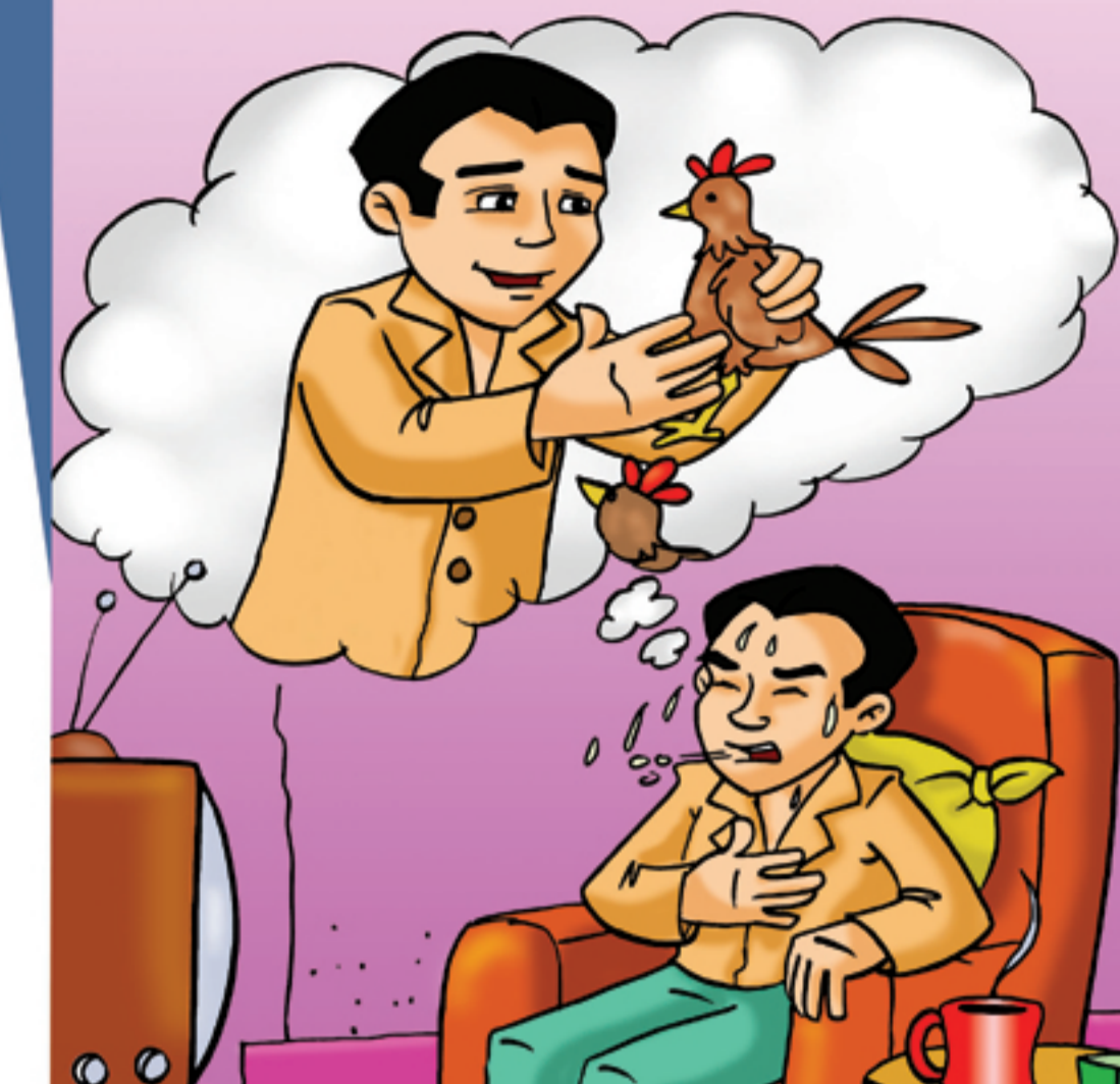
If you are working closely with birds and have flu-like symptoms, go to hospital immediately