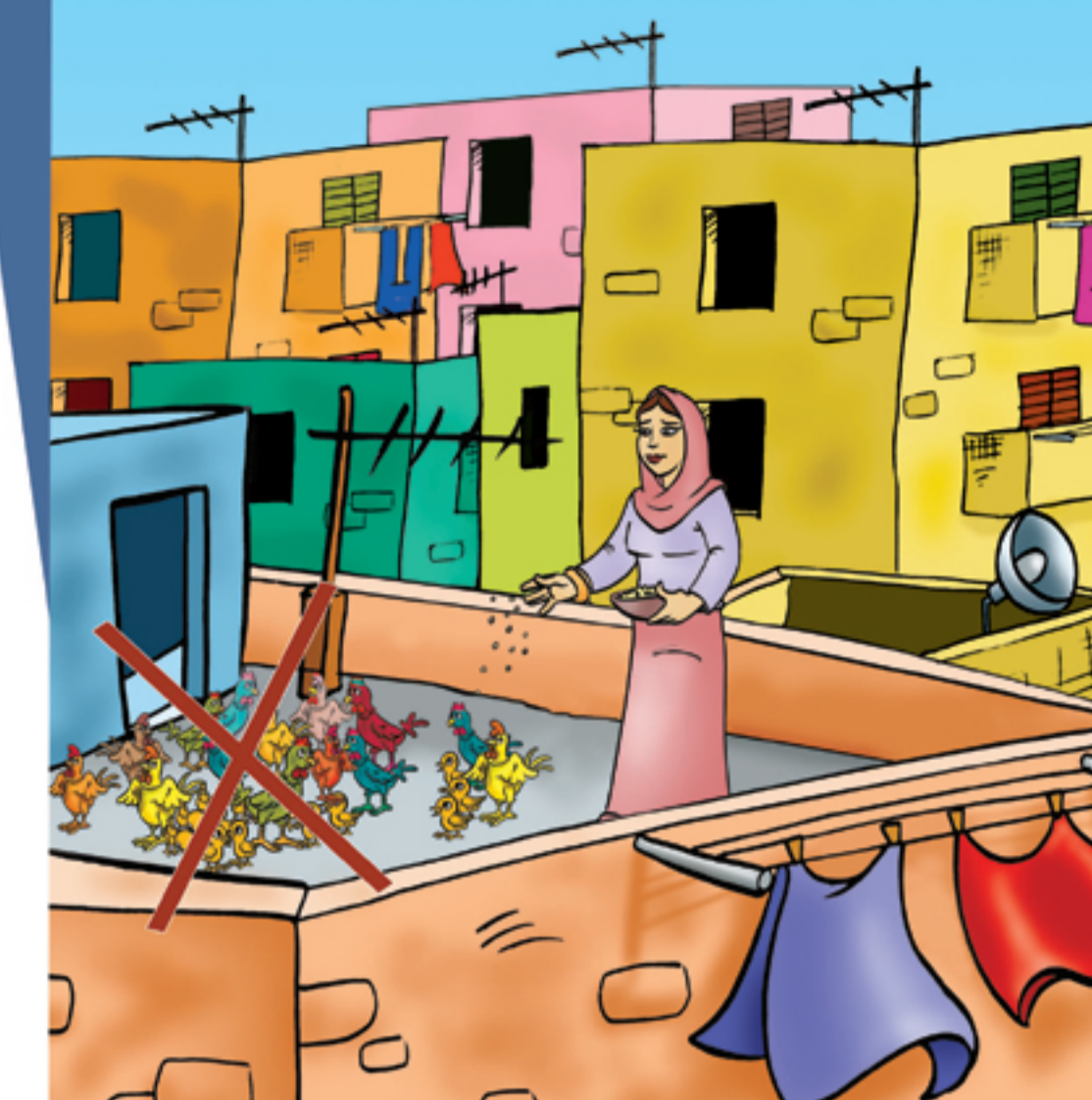
To prevent spread of disease, do not raise poultry on rooftops