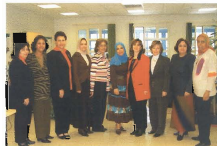
The fellowships team