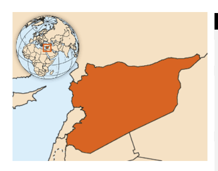
Map of the Syrian Arab Republic

WHO recently procured thousands of bottles of anti-lice shampoo. 4000 bottles of the shampoo were provided to the Ministry of Health and 500 to the Palestinian Charity Organization.