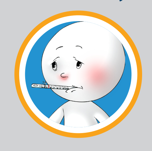
Fever (38° C and higher)