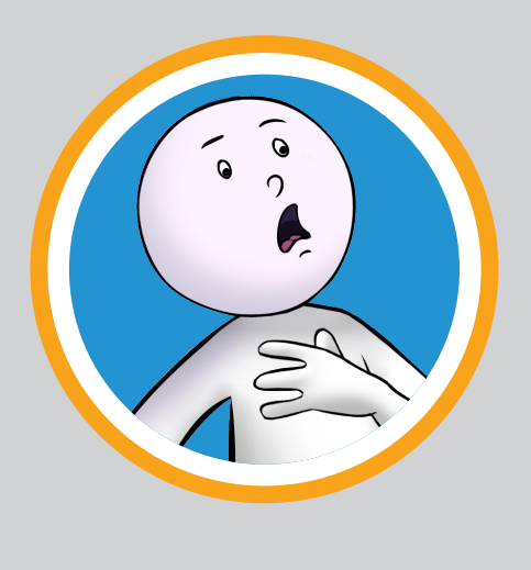
Difficulty in breathing

Be acutely aware of these symptoms among patients who have recently returned from countries affected by MERS-CoV or who have had contact with camels