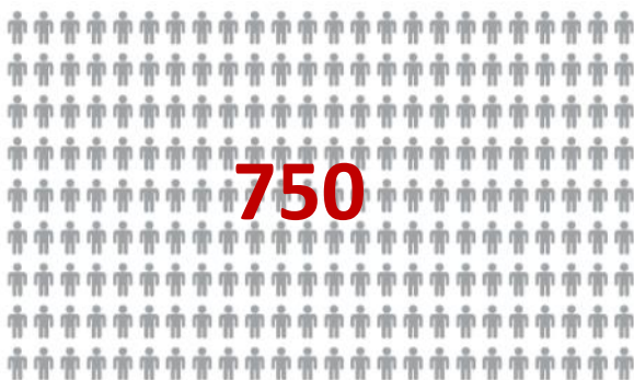
Health workers killed since crises began 2011-2016*