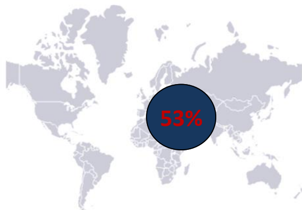
Percentage of all global attacks on health care occurring in Syria in 2015