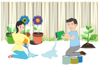
Clean or remove water from containers

Protect your family from Zika, dengue and other diseases by identifying and eliminating potential mosquito breeding sites.