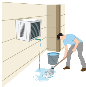
Eliminate all potential breeding sites