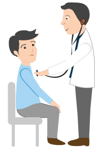
Seek medical advice early if you develop skin rash and/or fever