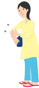
Use insect repellent