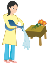
Change water once a week