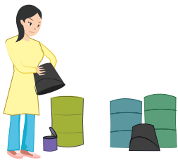
Turn containers upside down