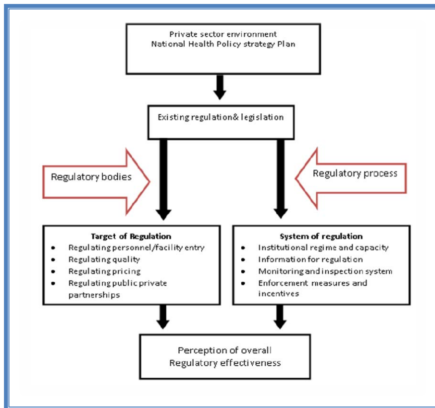
Fig.1. Regulatory framework to assess regulation of the private health sector in the Eastern Mediterranean Region

The research used the WHO generic instruments for key informant in-depth interviews and online surveys. The instruments were reviewed for consistency and completeness. An orientation workshop, “Assessing the regulation of the private health sector in the Eastern Mediterranean Region: Phase I: Egypt and Yemen”, was organized by the Social Research Center, American University in Cairo (AUC) and WHO in Cairo on 19 and 20 December 2012. The workshop was arranged to justify the need for the research, share research experience in other countries/regions and train interviewers/facilitators on the research instruments. This allowed the research team to better acquaint themselves with the importance of the research; to come to an agreement on the appropriateness of the instruments; and to be better prepared for the field work. The Social Research Center used participants’ recommendations to modify the research instruments and guide the field work. English and Arabic versions of all instruments are available from WHO Regional Office for the Eastern Mediterranean.