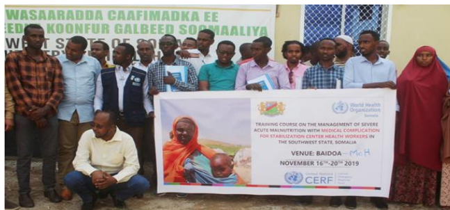
Photo 2: WHO public health officers conducted EWARN training in Baidoa town as a part of EWARN expansion strategy under CERF project November 2019