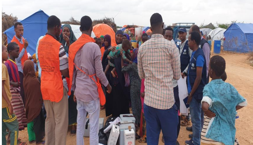
Photo 1: WHO staff supervise integrated measles and polio vaccination campaign in Hirshabelle state in November 2019