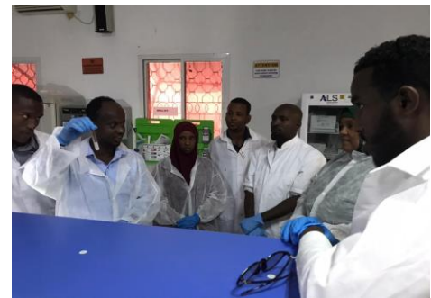
Training of laboratory technicians and health workers on sample collection, packaging and shipment was conducted in Mogadishu in December 2019