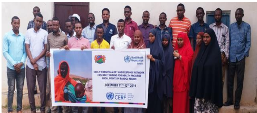
EWARN training for surveillance focal points conducted in Baidoa district, Southwest state in December 2019