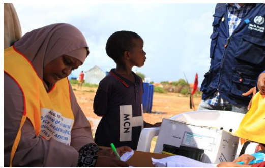
IERT providing primary health care to IDPs in Beletweyne District, December 2019