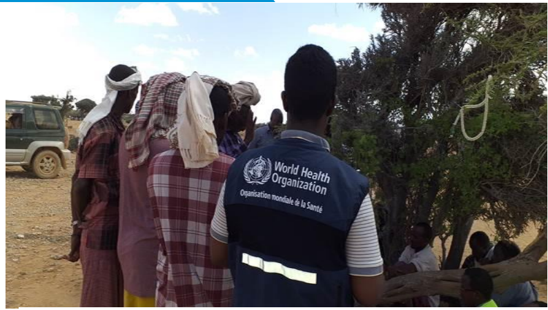
WHO Public Health Officer conducting field visit to a rural village of Galmudug State in Somalia