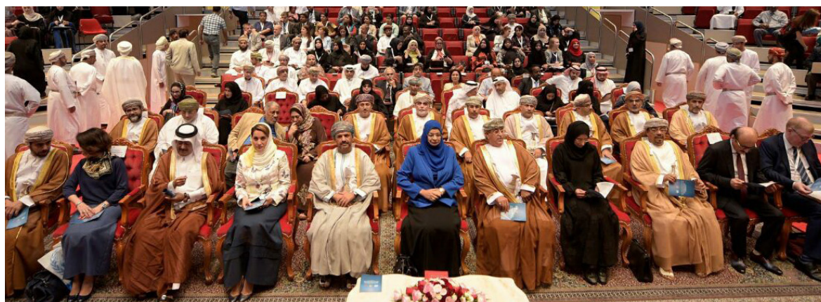
↑ Participants at the launch of the third Global Patient Safety Challenge “Medication Without Harm”

needed to improve the quality of certification of deaths using ICD-10 compliant certification forms.