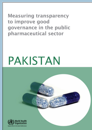
↑ Assessment measured transparency in the pharmaceutical sector in Pakistan

With the increasing involvement of the private sector in the education and work of the health workforce, health workforce regulation is more important than ever. Strengthening governance capacities is critical; a workshop on strengthening the health workforce was held in collaboration with the World Bank and the International Monetary Fund, and support was provided for the establishment of national medical and midwifery councils in several countries.