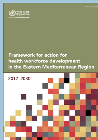
↑ Framework for action for health workforce development

A well-qualified and well-performing health workforce will be crucial for achieving universal health coverage. Countries continue to face an overall shortage of health workers in addition to imbalances in geographic distribution and skills mix. In particular, Afghanistan, Djibouti, Pakistan, Somalia, Sudan and Yemen have a critical shortage of health workers. Furthermore, protracted crises have led to a loss of health workers and interruptions in health professionals' education, exacerbating the gaps. The safety and security of the remaining health workforce continue to be a major concern. A rapid influx of refugees in some countries has led to increased workload and a decline in health workforce densities.