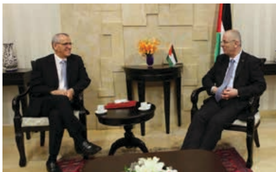
↑ The Regional Director met with Prime Minister HE Dr Rami Hamdallah to review strategic directions and future collaboration for the Palestinian National Institute of Public Health, a WHO-led project

Islamic Republic of Iran, Palestine, Saudi Arabia, Tunisia and United Arab Emirates). The quality of information reported improved somewhat but there is still work to be done to obtain optimal quality. A WHO collaborating centre was established in Kuwait to support further improvement in mortality statistics and better use of the WHO family of international classification.