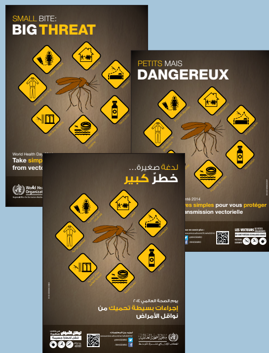
↑ World Health Day 2014

Health security continued to be high on the agenda throughout the past year, and its importance was brought home to governments and the public yet again as the outbreaks of Ebola virus disease spread in three countries in west Africa. The possibility of importation to the Region was a major concern to us. In response to a recommendation from the Regional Committee, WHO urgently undertook a comprehensive assessment of Member States' capacity to deal with a potential importation of Ebola. Between November 2014 and February 2015 rapid assessments of preparedness and