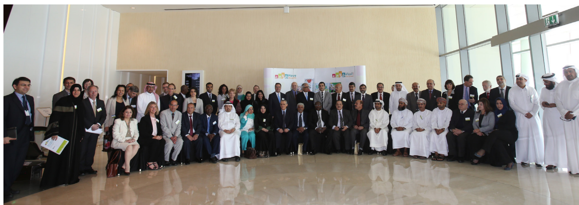
↑ Ministers and representatives of Member States from a broad range of sectors participated in a high-level regional forum on a life-course approach to promoting physical activity

Following endorsement in 2012 and 2013 by the Regional Committee of strategies and actions for health systems strengthening, countries were urged in 2014 to implement the framework for action for progressing towards universal health coverage. Several countries have taken important steps in this regard and all countries now have a clearer picture of what is needed to address the