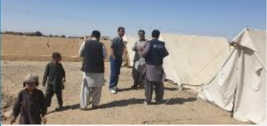
Flood relief assistance by WHO in Balochistan

services to the affected population and averted the immediate escalation of any adverse health situation.