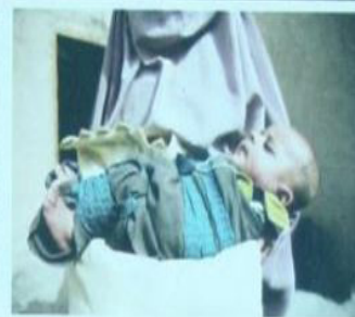
This little boy is sleeping when vaccinators arrive at his house, and he is lucky they are female, otherwise he might have missed the vaccine. Men are not allowed inside a private house unless they are immediate family members. This is why female polio workers are so critical. Over 35% of community

“Where I live, it is not safe for a woman to show her face. It is not easy to be a woman or child here. My cousin is just 11 years old and she is already engaged to be married soon. I am lucky. (my father) let me go to school and I have no pressures to get married, because I support my three unemployed brothers. However, if I wasn't working I would also be forced to marry. My job is not just saving children's lives, it is saving my own.” Southern Afghanistan is barren and stunning – a sweeping desert landscape enveloped by mountains. The area has a rich and proud history but it remains a key battleground in the ongoing conflict. This year, southern Afghanistan also has the highest number of polio cases in the world. Teams of polio vaccinators traverse the country on an almost monthly basis to try to reach every child, but inaccessible areas and distrust hamper immunization efforts. Many of these immunization campaigns are focused in Afghanistan's most conservative areas, where